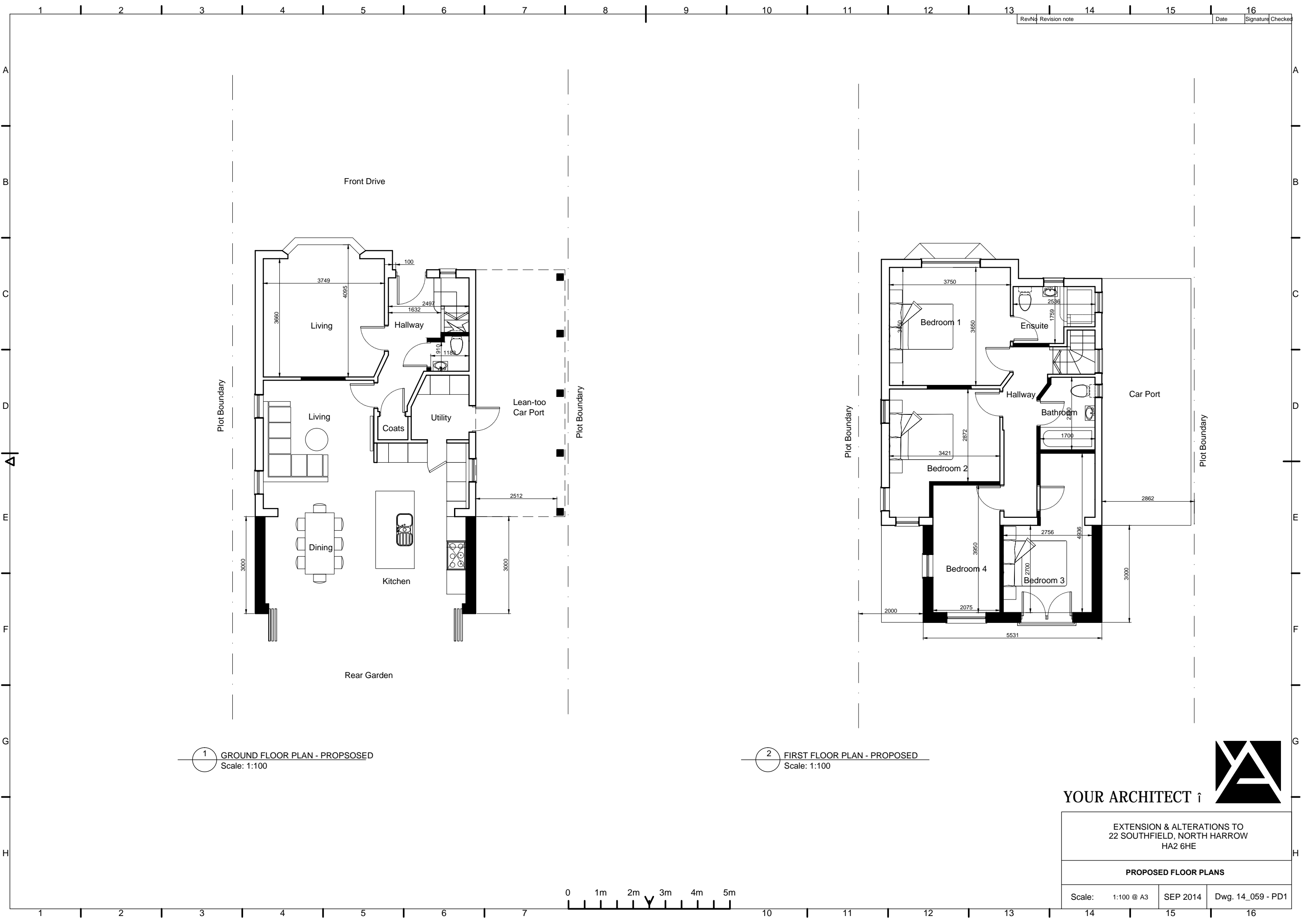
1 GROUND FLOOR PLAN - PROPOSED Scale: 1:100