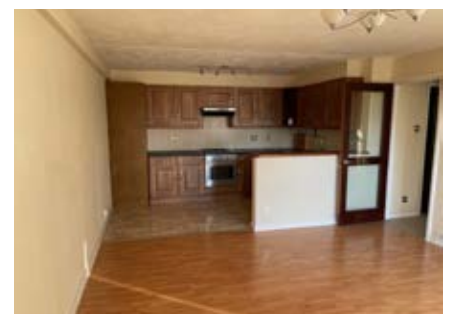
FIRST FLOOR 657 sq ft. (61.0 sq m.) approx.